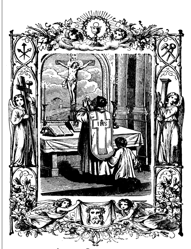
AT THE CONSECRATION.